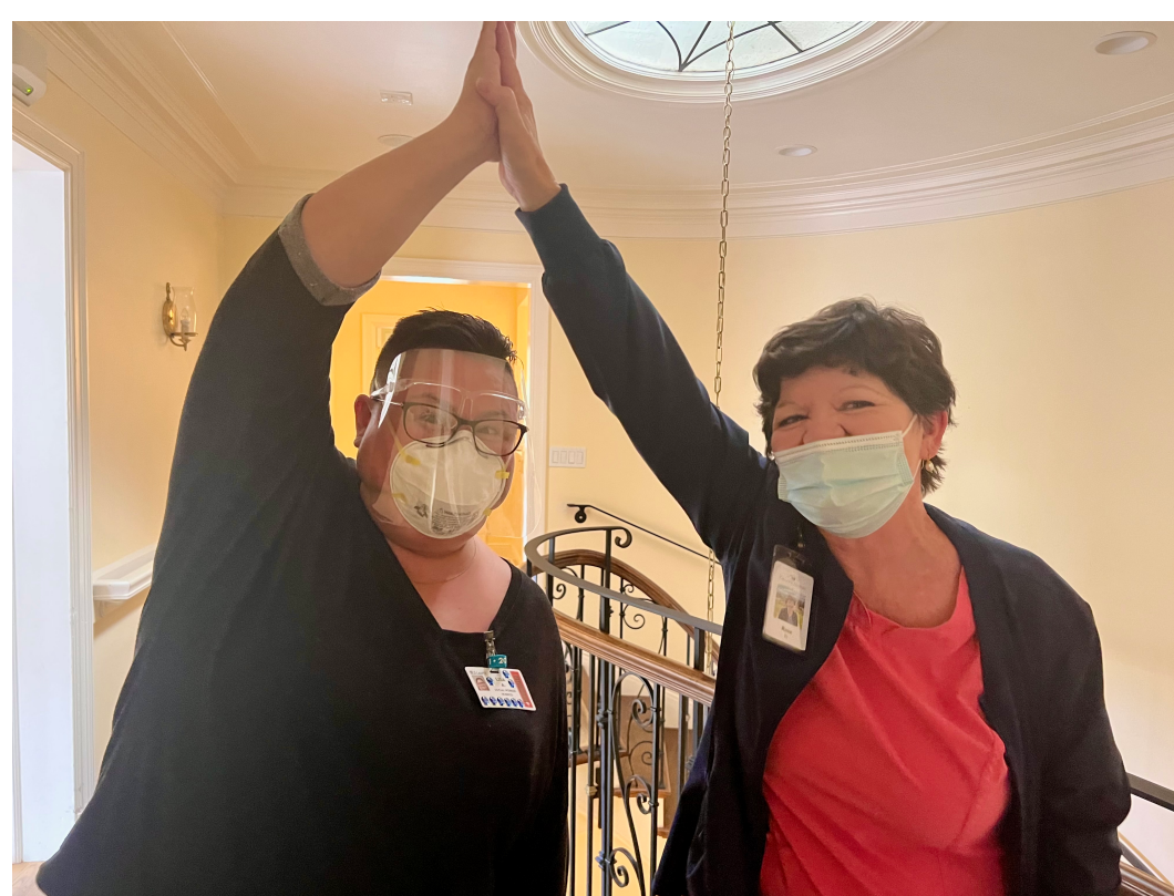
The relationship and communication between Celia's House staff and social workers remained strong throughout the challenging times of the Covid-19 Pandemic.