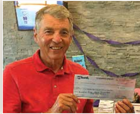
The final mortgage payment!